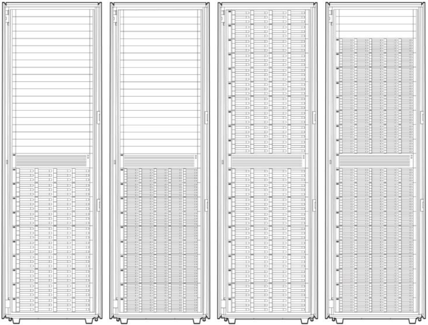
EVA P6350 2C10D